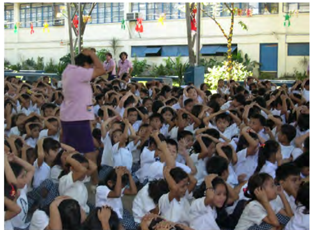
Students perform the "duck, cover and hold".