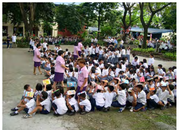
Teachers make a headcount of students at the designated evacuation area.