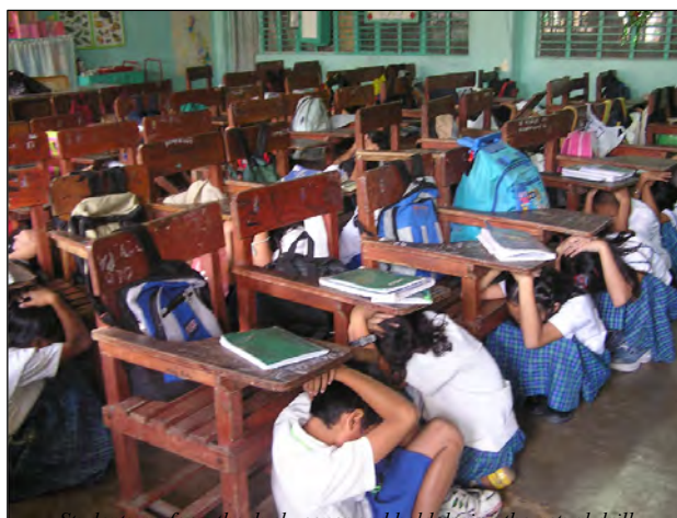
Students perform the duck, cover and hold during the actual drill.